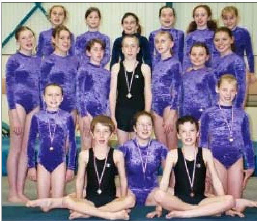
Breaking new ground: Members of the School's General Gymnastics Squad who did us proud at regional level. See the full report on page three.

Here's hoping for all the best during 2004